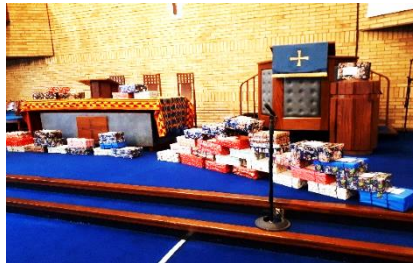
Some of the boxes at the Dedication service