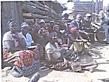
Some of the older vulnerable people of Kandabwe

600 kilometres to the North in Kitwe, Jane continues to develop Play4all and is now working with a former social work student of mine from 2011, Kabutu, in a compound called Kandabwe. His