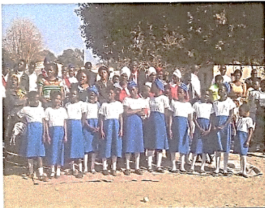
The Girls Brigade wait to deliver a small play for Mabel

This is a slightly longer letter, but as you can see as you read on, the last few months have been quite busy.