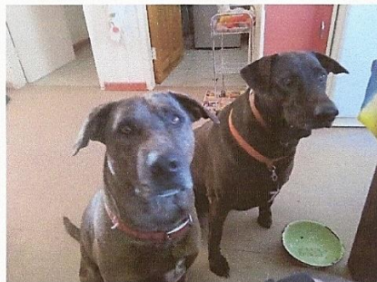
Rocky and Jet wait for their dinner – this time “caught” by me!

Websites www.chodort.org www.play4all.org